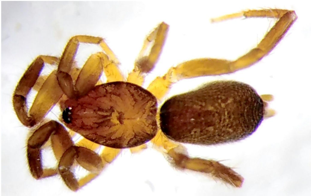
Fig. 2. General habitus of Lasophorus zografae Chatzaki, 2018 ♂, dorsal view, from Meydan Plateau area, Adana Province.

Collected specimens: 2♂♂, Adana Province: İbrişim village (37°31'87"N, 35°19'33"E), alt. 896 m, 16.VI.2017, leg. Hakan Demir.