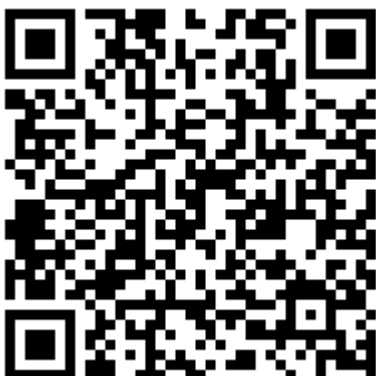
SCAN QR Code for video class